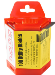
100-Pack in Dispenser #01060